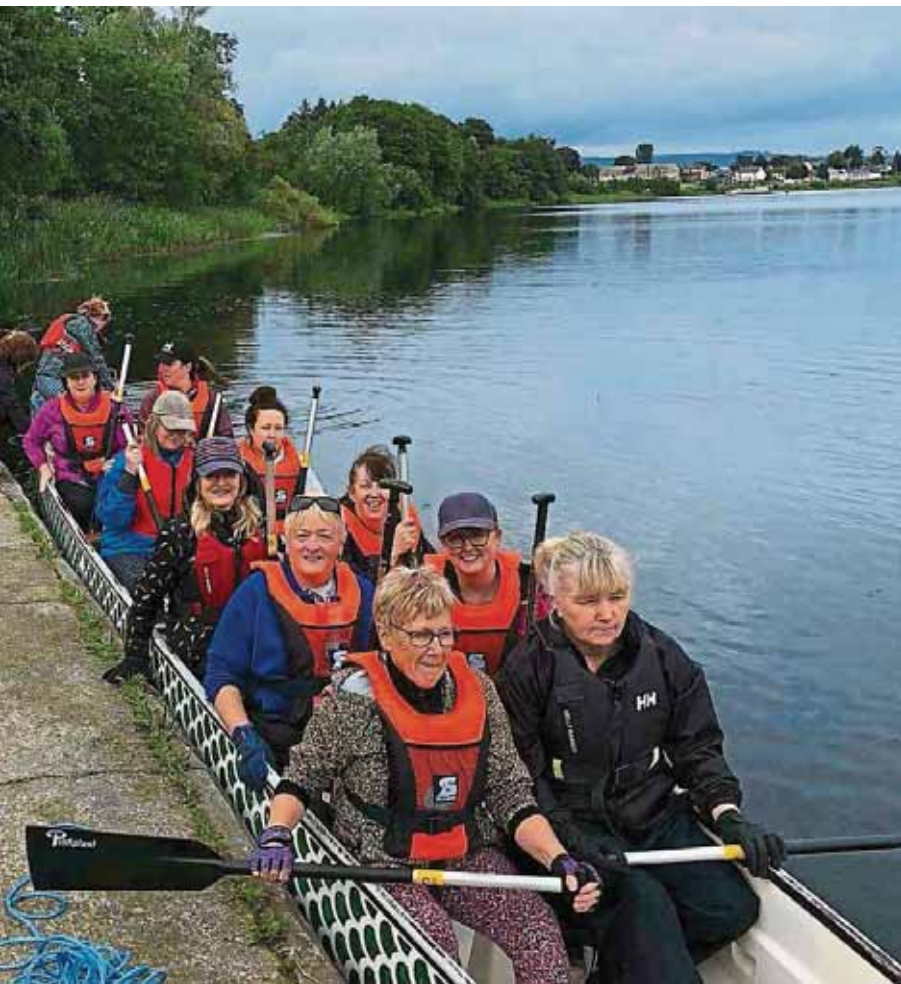
The Limerick Dragons training in O'Brien's Bridge

I have this chance at life that not everybody is granted. It gives you a new appreciation for life and it all makes sense."