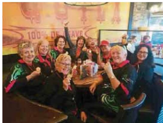
The Limerick Dragons celebrating after the Cork Regatta

"I just look at it as something that I have to get on with. I'm extremely lucky,