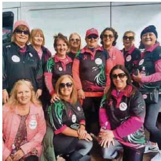
The Limerick Dragons after doing the 3for3 Breast Cancer Walk

On April 13 at noon, the Limerick Dragons will meet future members at the shipyard at O'Callaghan Strand. On April 20, they will be organising a flower ceremony, to remember anybody who has passed due to breast cancer.