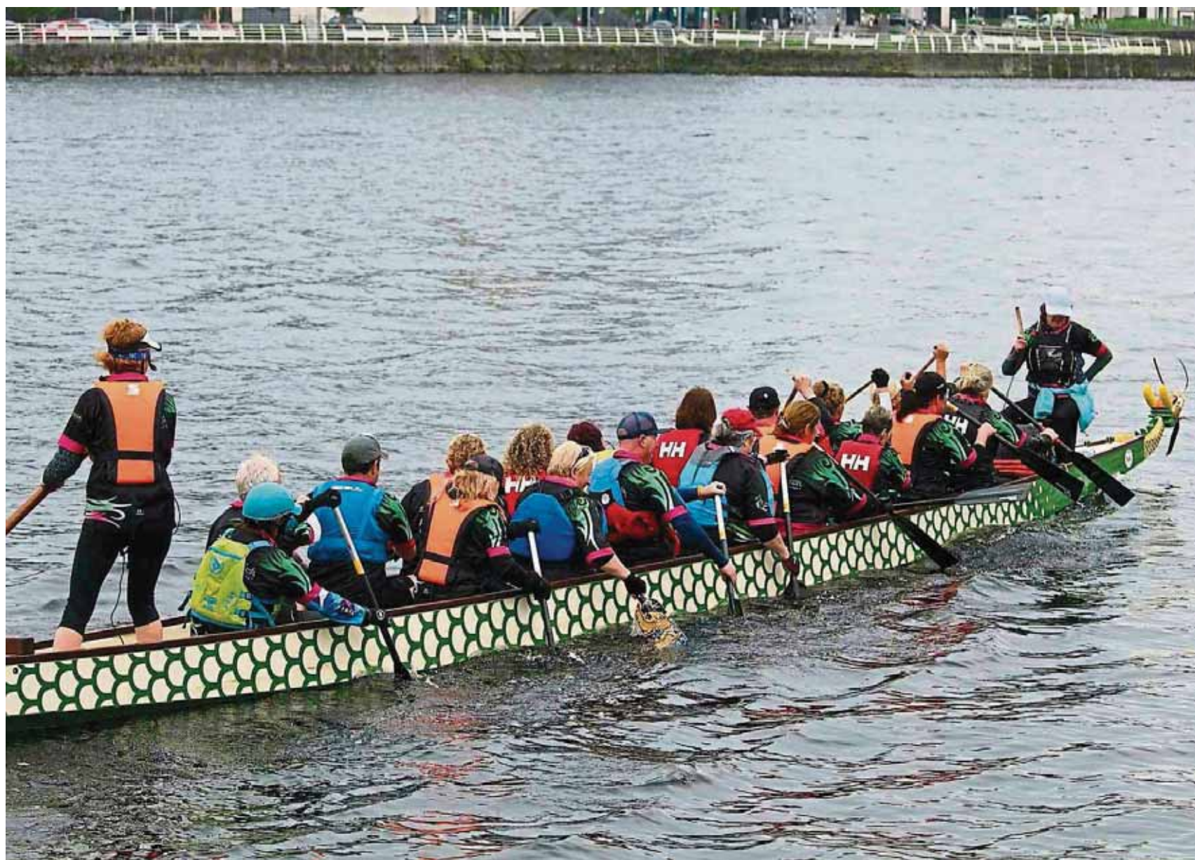
Limerick Dragons was founded in 2016 by a group of breast cancer survivors