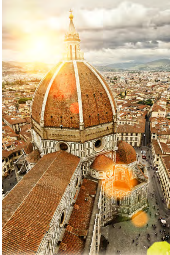
The spiritual centre of the City is the Piazza del Duomo with the Basilica of Santa Maria del Fiore, the third largest cathedral in the world after St Peter's in Rome and St Paul's in London.

Lunch will be provided at the race site on Saturday and Sunday and there will be lots of time between races to greet old friends, make new ones and,