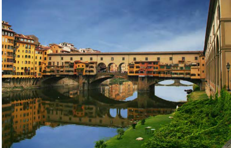
Florence Rowing Club is located just below the Uffizi Gallery and close to the Ponte Vecchio spanning the Arno River (above).

The spiritual centre of the City is the Piazza del Duomo with the Basilica of Santa Maria del Fiore, the third largest cathedral in the world after St Peter's in Rome and St Paul's in London. Imagine my delight in being shown the statues of Arnolfo di Cambio and Filippo Brunelleschi, the two architects responsible for the building of the Cathedral who will gaze up