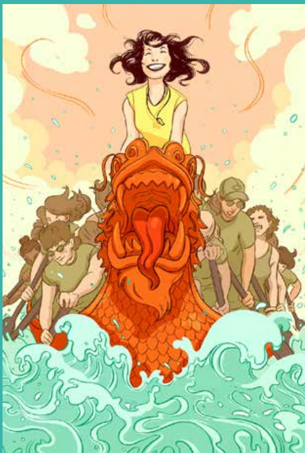
Illustration by: Rachel Idzerda

Then two minutes of full-body exertion begins. Unity is key. There are no stars in a dragon boat. Twenty paddlers propel the boat forward, their paddles entering and exiting the water at the same instant.