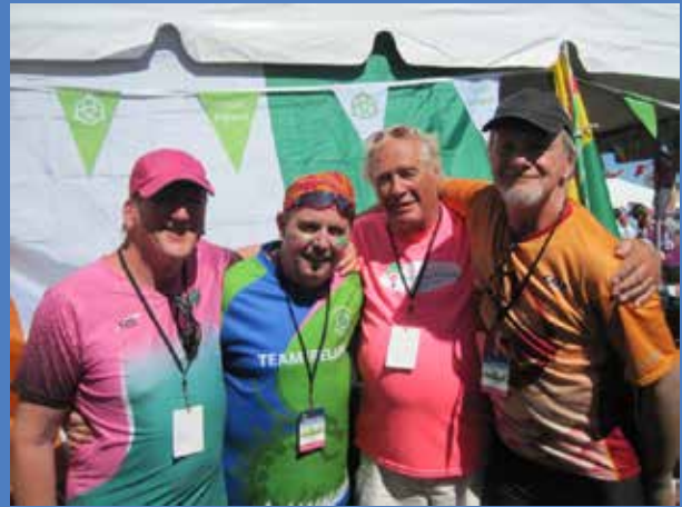
Four male breast cancer survivors attended and, three of them paddled, in the 2014 IBCPC Participatory Dragon Boat Festival in Sarasota Florida in October.

A book entitled Male Breast Cancer - Taking Control , for male breast cancer patients was published in March 2015 by an Australian Oncologist. As well a feature length documentary produced by Nick Sadler entitled Times Like These , intimately follows the inspiring lives of two men from different worlds diagnosed with breast cancer. The film spotlights how men struggle to find support and understanding while living with this disease. Filming began in June 2013 and it is estimated to be released in 2015.