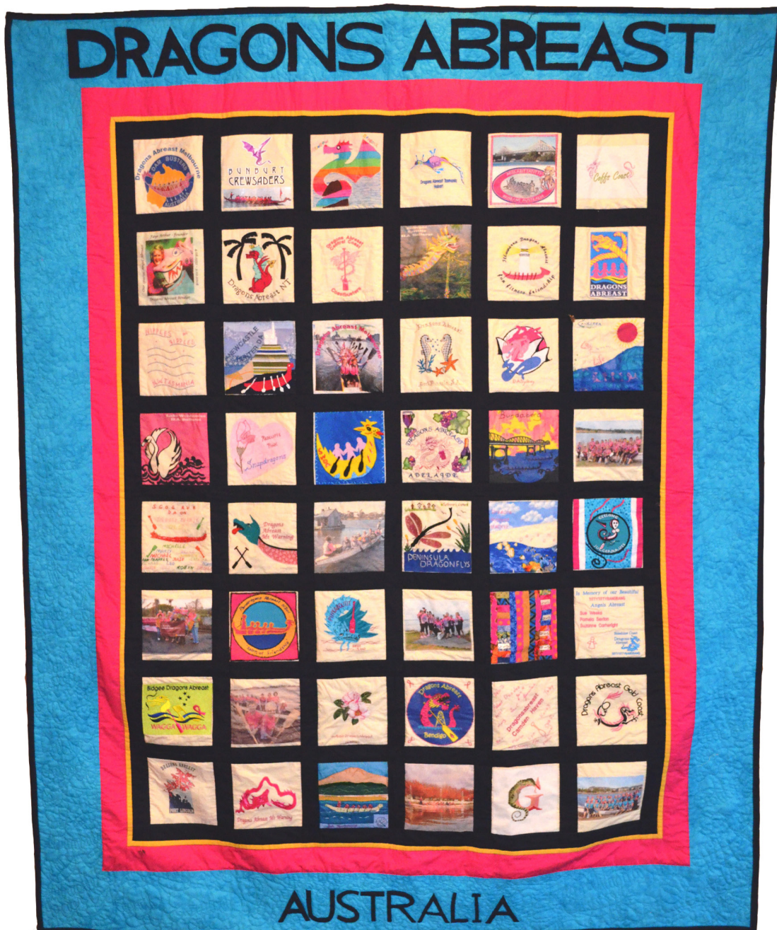
37 teams create quilt. (Story on page 2 )