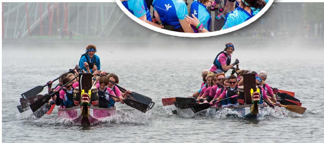
Inset: Plurabelle Paddlers huddle at the September Regatta. Above: The crew hard at practice