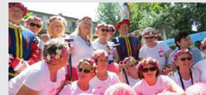
The Polish paddlers celebrated their 15th season wearing rose garlands in their hair when they joined their Italian sisters in Empoli on June 13, 2015. Their male supporters wore traditional Polish costumes and together the Polish men and women added an elegant touch to the happy occasion.