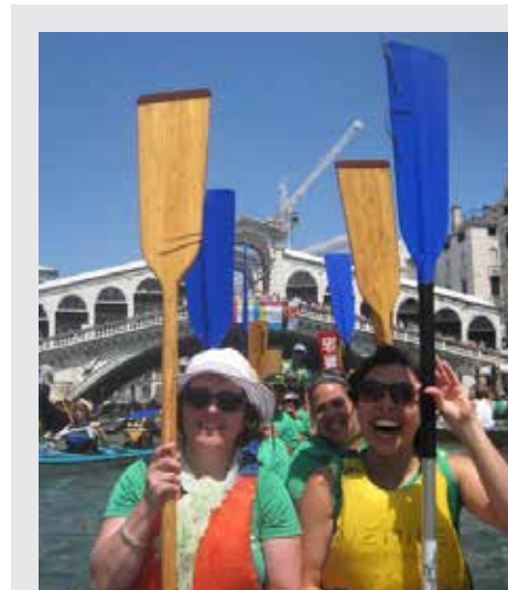
British Wave Walkers raising their paddles as they come out from under the Rialto Bridge in Venice, Italy during the 2015 Vogalonga.

Wave Walkers have also paddled with the breast cancer team, Pink Champagne from Bournemouth, Great Britain in the Henley Winter Series 2014 and with Rowbust from London, Ontario, Canada also in 2014 when they hosted an "Open Day" which the Wave Walkers do regularly in their efforts to raise awareness about cancer journeys and to recruit new members for their team. Visit: www.wavewalkers.co.uk